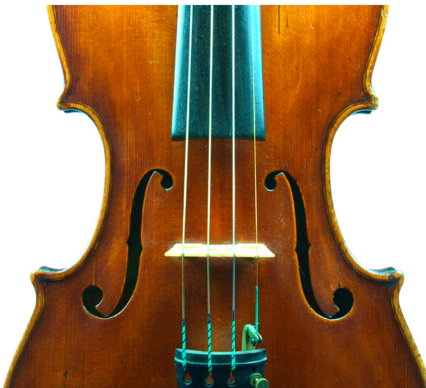
Figure 8. Benvenuto Pascoli, violin (São Paulo, 1930).

This instrument (Fig. 10) made in 1948 represents the return of Guido to violin making after several years dedicated to other activities. We can see in this instrument a set of important modifications in relation to the work of the previous decade. From the outline to the reddish varnish (clearly influenced by Lo Turco, who eventually became Guido's close friend), to the treatment of the arching, everything seems to