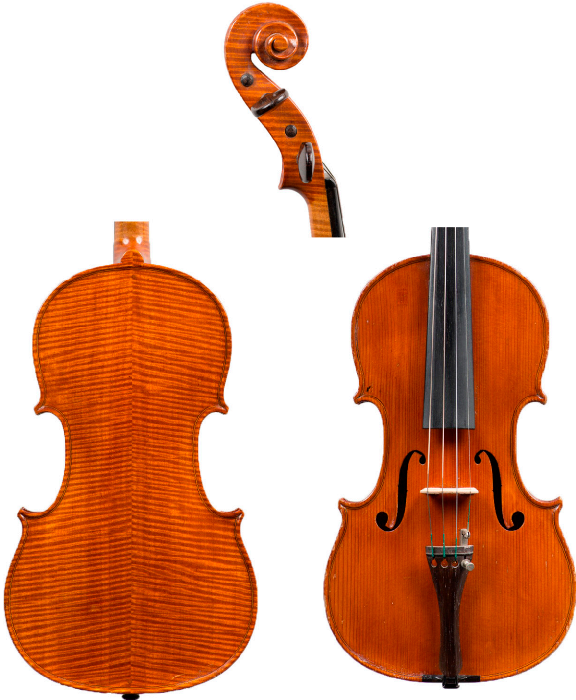
Figure 13. Luiz Bellini, violin (São Paulo, 1958).

stop are those of a conventional 42-cm viola. For this particular instrument, Guido used North American wood (Big Leaf Maple) for the back,