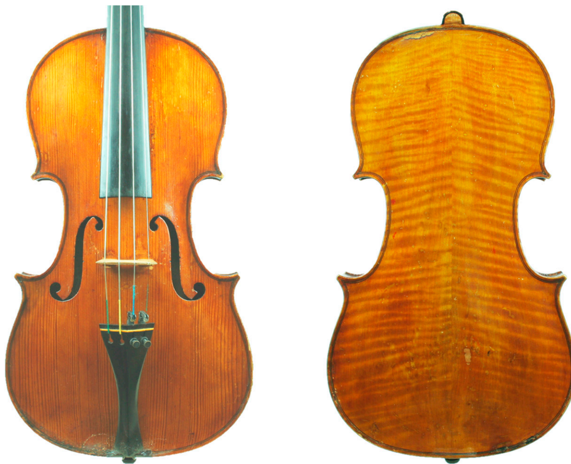
Figure 7. Ivo Incisi, violin (São Paulo, ca.1900) (Private Archives, Rafael Sando).

This rare and interesting specimen by Ivo Incisi (Fig. 7) is representative of the early efforts to approach the European violin making tradition by Brazilian local makers. The model is elegant, with well-cut open F-holes, in harmony with the long corners. The edge work is delicate, with neatly inserted purflings. The arching is low and flat, mainly because of the construction method used. The curvature of the belly and the back were obtained by bending the plates using heat, with very little carving. The wood of the belly is a quite dense pine with broad and resinous growth rings, probably from foreign origin. The back, the ribs, and the neck, are made with Grumixama ( Eugenia Brasiliensis ), a Brazilian wood. The neck and the scroll, despite the rather rough design, are cleanly executed. The varnish is straight-forward, of a light orange, applied directly on the