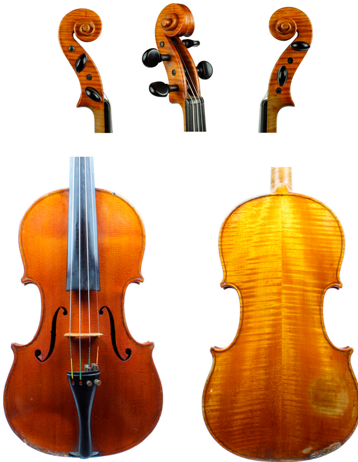
Figure 14. Guido Pascoli, violin (São Paulo, 1961) (Private Archives, Rafael Sando).