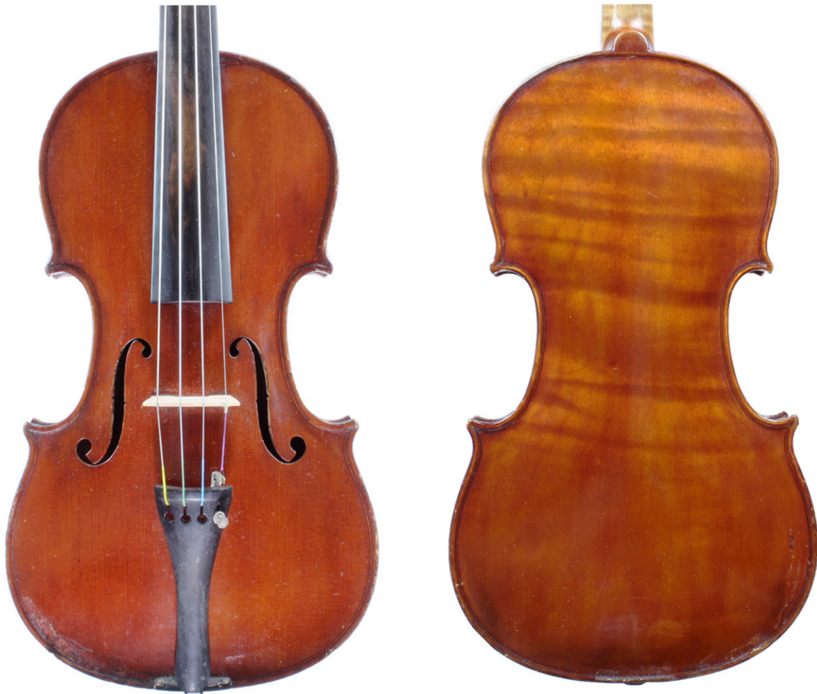
Figure 10. Guido Pascoli, violin (Rio de Janeiro, 1948) (Private Archives, Rafael Sando).

indicate an evolution toward a new style. The model is personal and quite different from that of the 1930s. This instrument is slightly shorter (355 mm) and has more “Stradivarian” proportions. The edge work is also very distinctive, with a broader, well-defined channel merging into the arching in Cremonese style. The original printed label states that the top was made from old spruce salvaged from the demolition of the Theatro Lyrico .