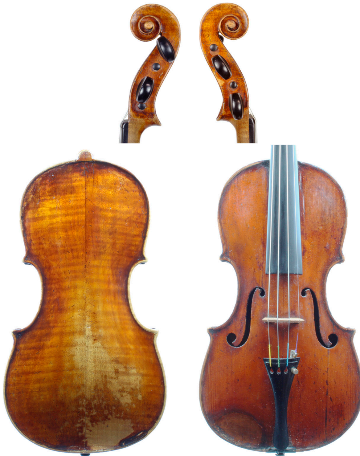
Figure 9. Benvenuto Pascoli, violin (São Paulo, ca. 1935–40).